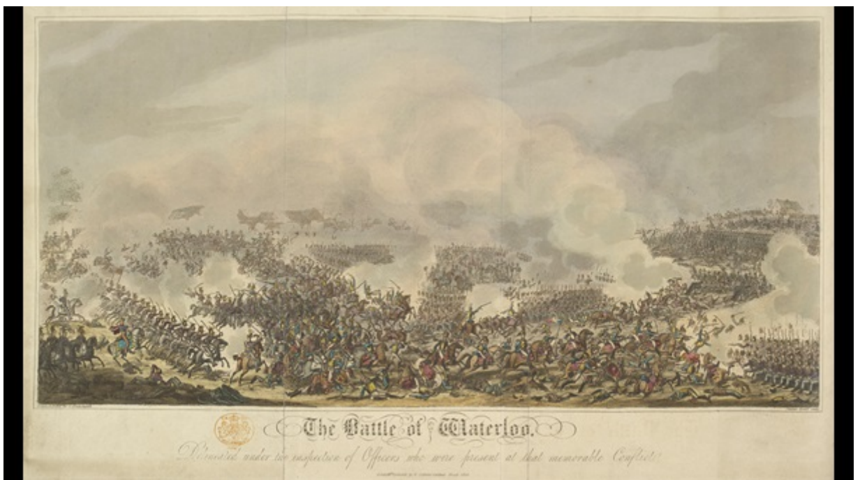
The Battle of Waterloo (1815) marked the end of the Napoleonic wars, which, with the French Revolutionary wars, had occupied the European powers for over 20 years. This illustration is by George Cruikshank.

Usage terms Public Domain [http://creativecommons.org/publicdomain/mark/1.0/]